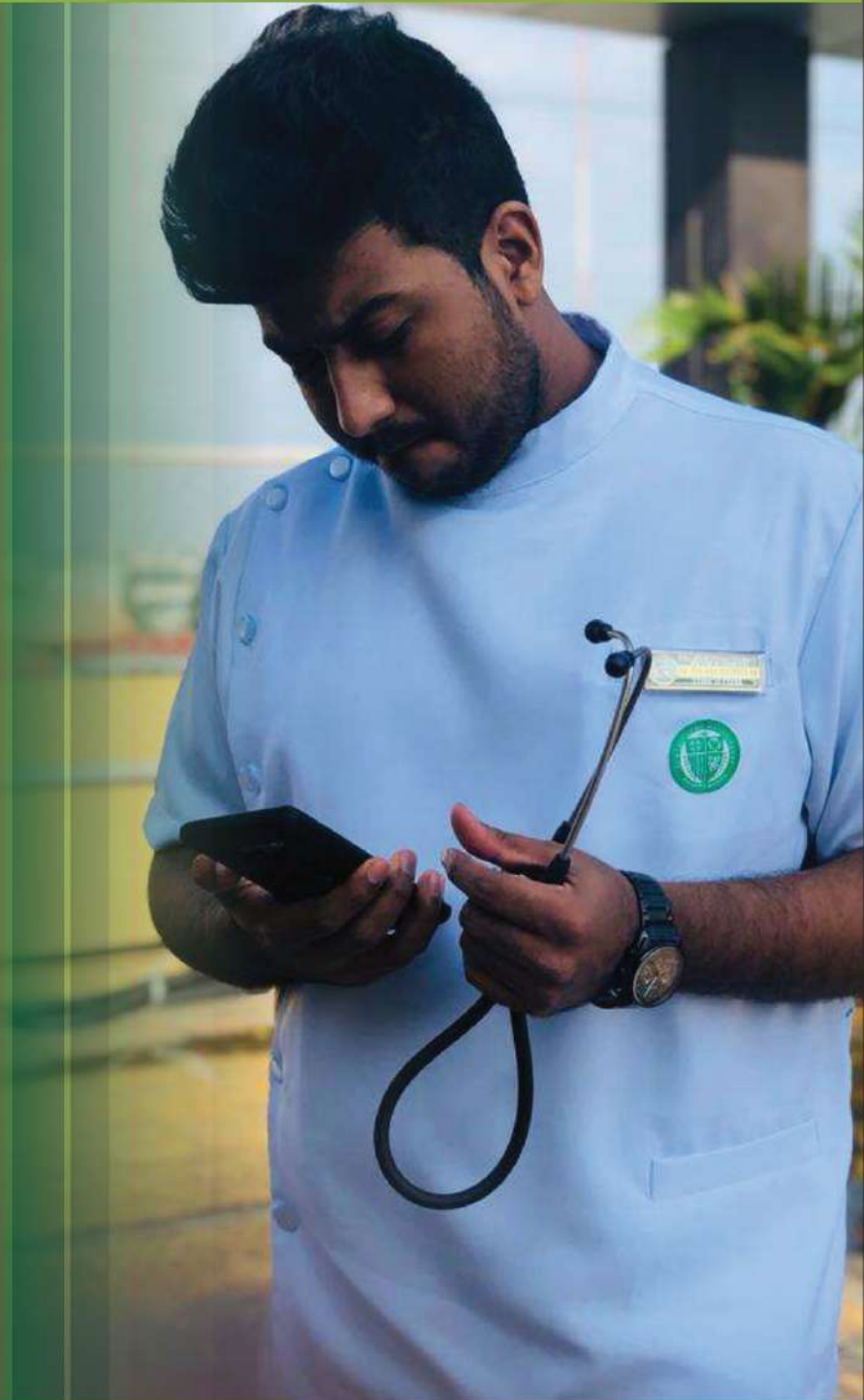
ACTUAL PHOTO OF OLFU STUDENTS