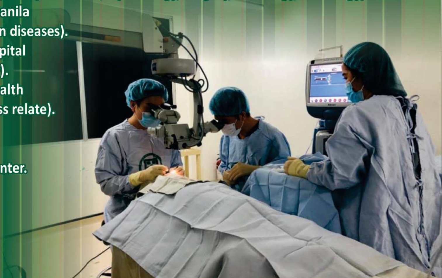
ACTUAL PHOTO OF OLFU STUDENTS