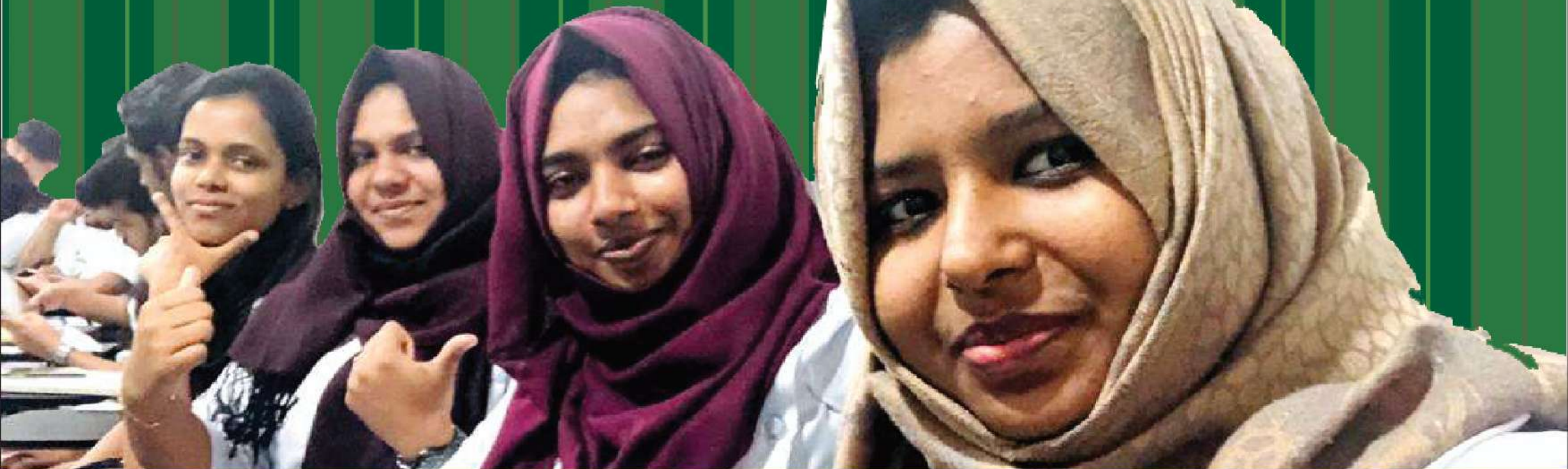
ACTUAL PHOTO OF OLFU STUDENTS